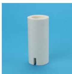
AR816 (605-816) Pedestal