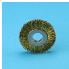
AR163 (604-163) Combustion Tube Brush

For a complete list visit our website: www.alpharesources.com