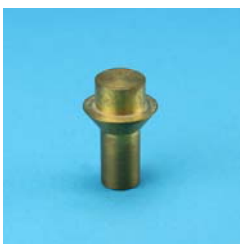
AR815 (605-815) Pedestal Adapter