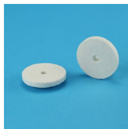
Crucible Covers AR040 (528-040) 4mm Hole