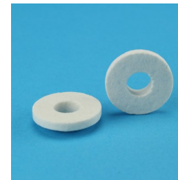
Crucible Covers AR9880 (619-880) 10mm Hole