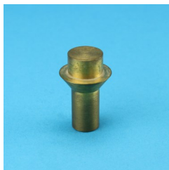
AR815 (605-815) Pedestal Adapter