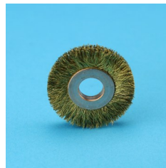
AR163 (604-163) Combustion Tube Brush

For a complete list visit our website: www.alpharesources.com