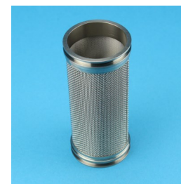
Stainless Steel Dust Filter AR596 (778-596) w/ Autocleaner AR311 (773-311) w/o Autocleaner