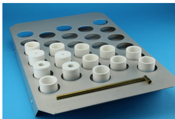
Crucible Tray Holder AR1265 (501-265)

Also shown AR579 Metal Scoop Designed for tungsten accelerator