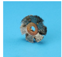
AR735 (610-735) Combustion Tube Brush