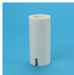
AR816 (605-816) Pedestal