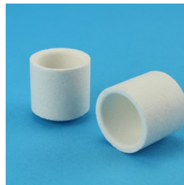
Ceramic Crucibles Foil Wrapped or Bagged AR3818F or AR3818 NEW High Purity Crucibles AR3818HP Foil Wrapped Box of 500