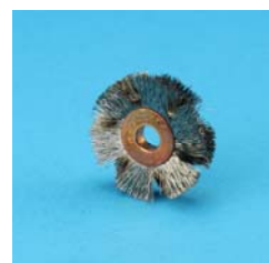
AR735 (610-735) Combustion Tube Brush