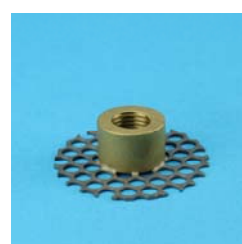
AR6922 (776-992) Shield and Collar