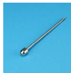
AR789 (789-115) Lance w/ Autocleaner AR9118 (789-118) Lance w/o Autocleaner