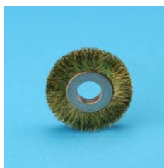
AR163 (604-163) Combustion Tube Brush

For a complete list visit our website: www.alpharesources.com