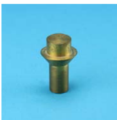
AR815 (605-815) Pedestal Adapter