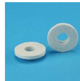
Crucible Covers AR9880 (619-880) 10mm Hole