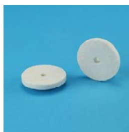
Crucible Covers AR040 (528-040) 4mm Hole