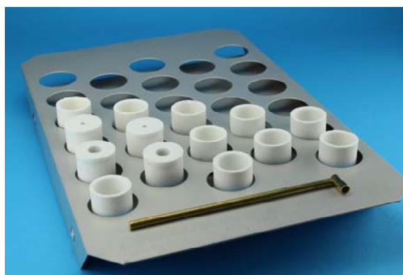
Crucible Tray Holder AR1265 (501-265)

Also shown AR579 Metal Scoop Designed for tungsten accelerator