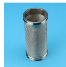
Stainless Steel Dust Filter AR596 (778-596) w/ Autocleaner AR311 (773-311) w/o Autocleaner