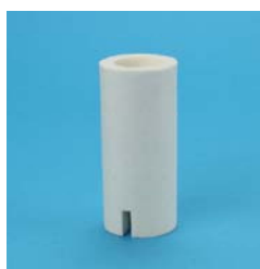
AR816 (605-816) Pedestal