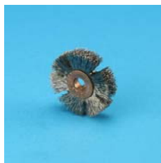
AR561(773-561) Combustion Tube Brush

For a complete list visit our website: www.alpharesources.com