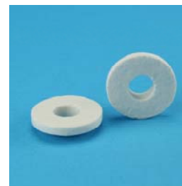
Crucible Covers AR9880 (619-880) 10mm Hole