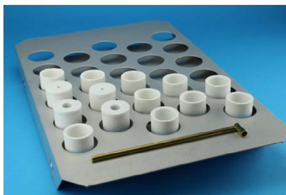
Crucible Tray Holder AR1265 (501-265)

Also shown AR579 Metal Scoop Designed for tungsten accelerator