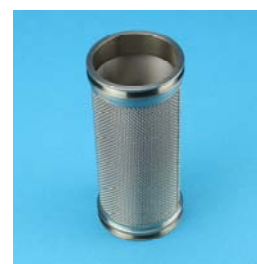
Stainless Steel Dust Filter AR596 (778-596) w/ Autocleaner AR311 (773-311) w/o Autocleaner