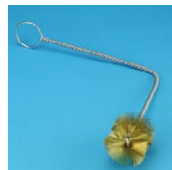
AR002B (501-082) Combustion Tube Brush