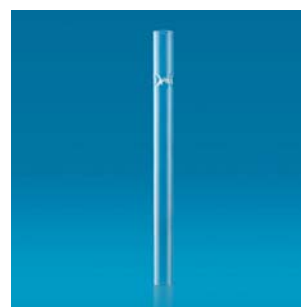
Quartz Tube for Oxidation Furnace AR104001 (JW-Z010104001)