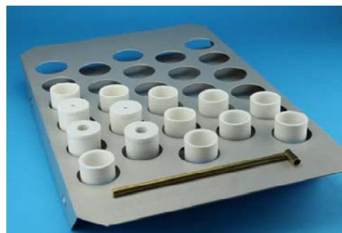
Metal Crucible Holder Tray AR1265

For a complete list visit our website: www.alpharesources.com