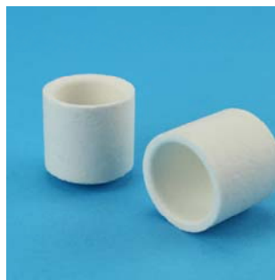
Ceramic Crucibles Foil Wrapped or Bagged AR3818F or AR3818 NEW High Purity Crucibles AR3818HP Foil Wrapped Box of 500