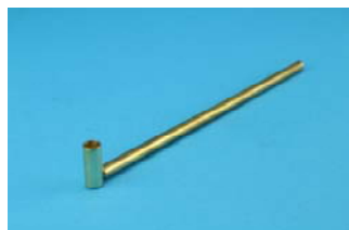
Tungsten Scoop AR579