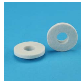
Crucible Covers AR9880 10mm Hole