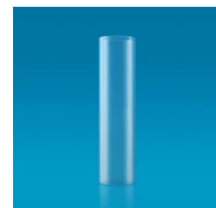
Combustion Tube AR14130 (JW-K4448010)