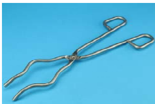
Crucible Tongs AR929