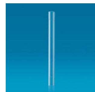
Reagent Tube AR103650 (Q103650)