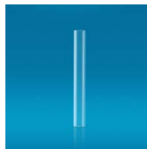
Quartz Tube AR430808 (JW-K430808A00)